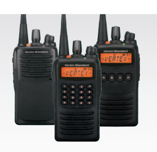
VX-450 Series Durable On-The-Job Performance