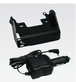
Vehicle Charger Mounting Adaptor VCM-2 / VCM-3